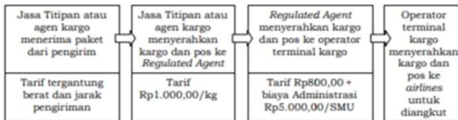
Figure IV. 4 Cargo Delivery Flow After RA (KPPU:2007)

The picture above shows that even though there is a reduction in airport management activities, airport managers still impose tariffs that do not provide welfare for businesses and consumers at all, which have an impact on the public interest in the form of high logistics costs which will affect the national economy. This is due to additional fees charged to PT AP II service users. If the cargo sent is