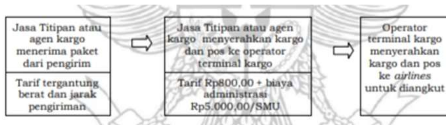
Figure IV. 3 Cargo Delivery Flow Before RA (KPPU:2007)

The following is the flow of the delivery process at Kualanamu Airport - Medan before and after the enactment of RA: