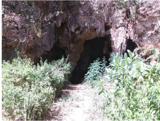
Fig. 5 Ecotourism Area Of Goa Bangkang Gunung Prabu

The manager of goa tourist area will apply the dress code to cover the awrah using local woven cloth for tourists visiting the cave to maintain the sacredness value of the tourist attraction.