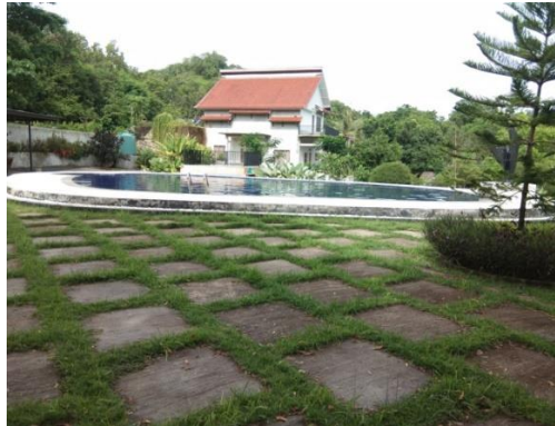
Fig. 7 Utilization of Forest Area to Become Tirta Tourism Attraction

Tourism potential developed by Pokdarwis in prabu mountain area is tirta tourism business. Tirta tourism business in the form of a bathing pool is privately owned by the chairman of Pokadarwis which was built from the profit from the gold mining activities of Mount Prabu. The management of this bathing pool is in collaboration with Pokdarwis. The business of tirta tourism facilities in the prabu mountain area has only started since 2018. Goa Bangkang tourism object first developed, then through pokdarwis initiative this tourist attraction was developed into tirta tourism. The utilization of wsata area into a bathing tour can be seen in Figure 7.