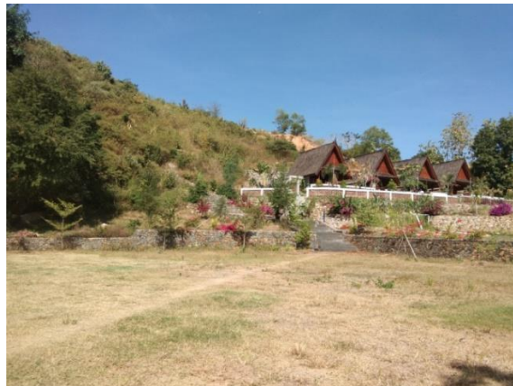
Fig. 6 Potential Camping Ground area in Gunung Prabu Ecotourism Area.

The vast forest and natural areas make the area of Prabu mountain ecotourism destination very potential to be developed into a camp area. The natural panorama of the hills will be a plus for wisatwan to choose to carry out camping ground activities in this area. Experience and explore the forest can be a special attraction for tourists who like camping tours. In addition, springs are available under the hill in the form of small wells ( Mbul ). This campsite service can be combined with hiking activities exploring hills and forest areas and plantations of residents. This activity can also be combined with research and tree planting activities. Prabu mountain ecotourism destination becomes a camp area can be seen in Figure 6.