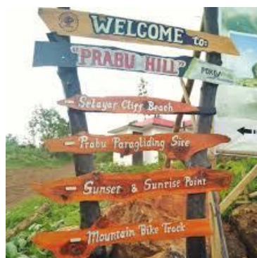
Fig. 3 Information Board of Gunung Prabu Ecotourism Attractions Created by Pokdarwis

Chairman Pokdarwis also explained the initial activity that has been done is the creation of information boards. This information board is placed at the entrance to the area of gunung Prabu to provide an overview of the tourist attractions contained in it. This information board is created independently and self-funding for the contributions of pokdarwis administrators can be seen in Figure 3.