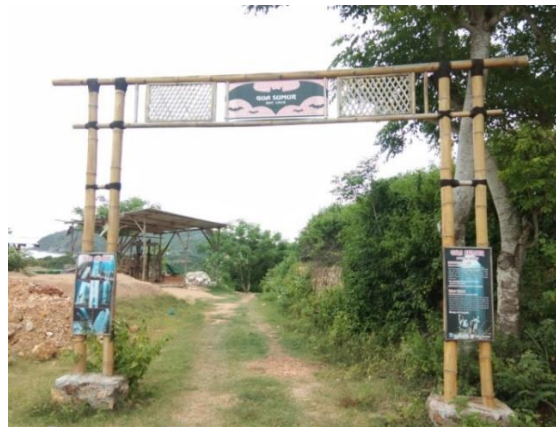
Fig. 4 Entrance to the attraction Goa Sumur Gunung Prabu

One form of tourist attraction established by the tour conscious group prabu village can be seen in Figure 4.