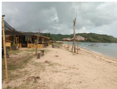
Fig. 8 Tebuaq-Are Guling Beach Attractions

The geographical location of prabu village in the south is directly adjacent to the Indian Ocean making the prabu mountain ecotourism area has several coastal objects such as Selayar beach and Are Guling. Are Guling beach area is one of the beaches that are used by local residents as the location of The Sweep. The location of the sing-down is the location of the beach that is used by residents as a place to carry out the tradition of smelling nyale. Nylae smell tradition is a tradition of catching luat worms that become a cultural tourist attraction. This tradition is carried out annually on the 20th day of the 10th month of sasaq calendar (Informant 04). Are Guling beach attractions can be seen in Figure 8.