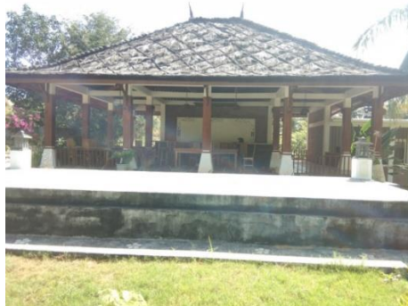
Fig. 9 Halal Restaurant Owned by Chairman of Pokdarwis Prabu Village

This halal restaurant is made from the personal processing of prabu mountain gold mine. The halal restaurant owned by the chairman of Pokdarwis can be seen in figure 9.