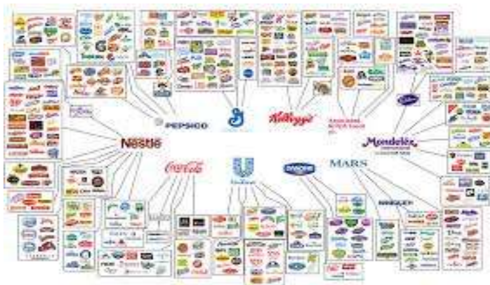
Fig.2. Food brands

According to a broader approach to the term brand, it is important for branding theories to clarify the local brand concept. National brands represent the Republic of Uzbekistan in the international market. So far, attempts have been made to see the company (entrepreneurs) or the brand of their products on a domestic market scale. For this reason, the use of the term "local brand" is scientifically and methodologically expedient. Of course, in the food market, it becomes a "national brand" only when it is as exportable as fruits and vegetables. These circumstances require the creation of scientific-methodological, practical and theoretical aspects, methodological bases for the formation of local brands in the food market.