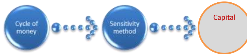
Figure 1: S.M. (Sensitivity Method)

The previous scheme followed the methodology of the Sensitivity Method to determine the behavior of the global tax revenue in the case that the existence of the capital and the ideal case that this factor is avoided.